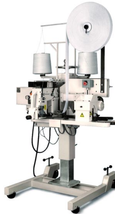
US400 with BC111T11-I and GB29910XI