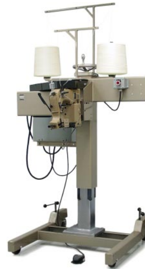
US100 with 80800C