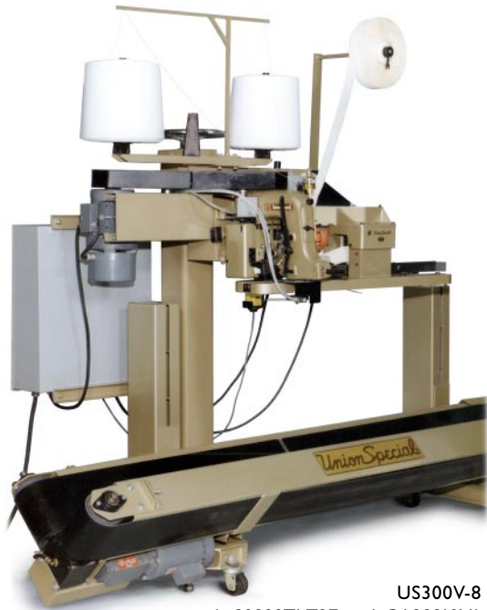
US300V-8 with 80800TLZ27 and GA29910XI