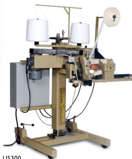
US300 with 80800UALZ29 and GA29910XI