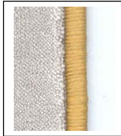
RIGHT : DK 2500